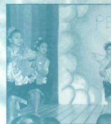
South London, UK 'Children for Peace' Interfaith