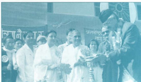
Kathmandu, Nepal: Minister for Tourism and Civil Aviation, Mr Tarani Datta Chataut, inaugurating the launching of Manifesto 2000 by lighting Nepalese traditional lamp, on the Nepalese New Year Day of 2057 BS.

The Nepalese New Year celebrations coincided with the IYCP launch in Kathmandu on the 13th April, which was held at the Nepal Film Development Company. Mr Tarani Datta Chataut, Minister for Tourism and Civil Aviation, formally began the event by lighting a lamp and signed his commitment to peace in front of a gathering of 900 people. The event received national coverage on radio, television and in the newspapers.