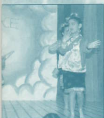
rogramme in February.